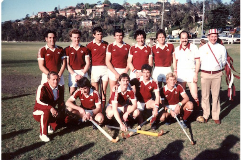
GDHC 1982 1st Grade Premiership winning side at Primrose Park North Sydney.