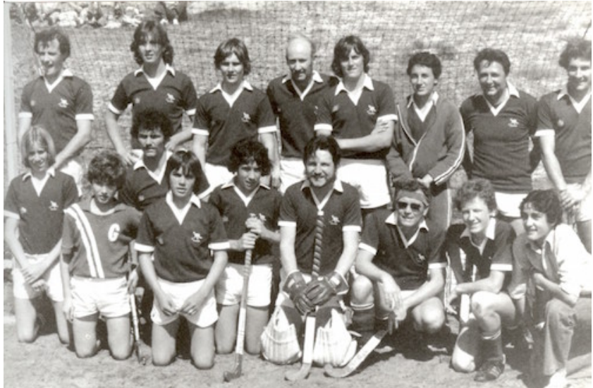
GDHC 1978 Glebe sixth grade team which won the 2nd Division C Grade Premiership photo taken at Heffron Park Maroubra.