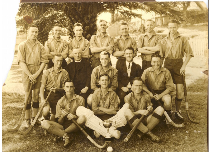
Reserve Grade Premiers - 1932

Most of the information for this Biography comes from the GDHC's Annual Reports, which stretch back to 1937 and the Club's AGM Minute Book, which had its first entry in December 1932.