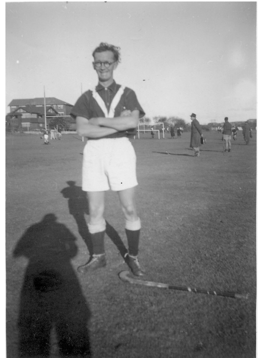
Photo taken at the Cranbrook School Playing ground 5 Victoria Rd Bellevue Hill