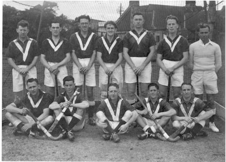
GDHC 1937 - 1938 2nd Grade team