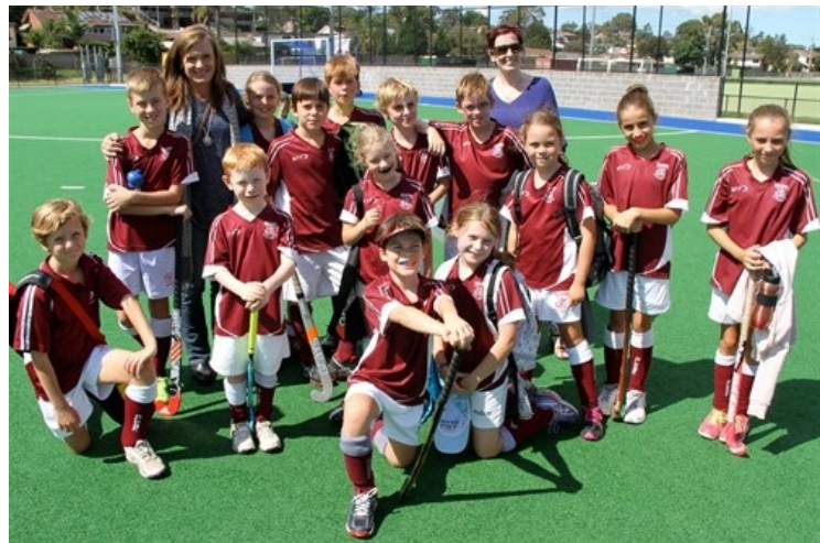
U11 - A Redbacks 2015