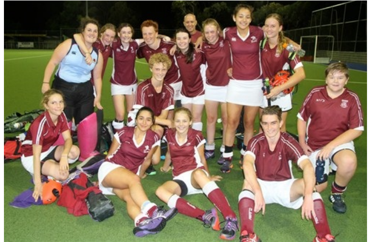
U/17 - A Redbacks 2015