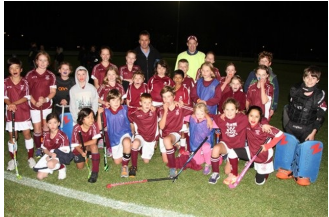
Juniors had a ball at Jubilee Oval for Glebe at Glebe Night.

"Not so long ago I was once were these young kids were playing for the sheer fun and enjoyment of the game."