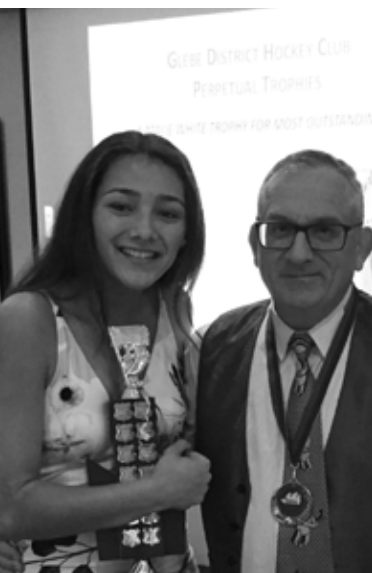
Latiana Field Natalie White Trophy

Awarded annually to the junior player (under 18 years of age) who has displayed the most potential throughout the year.