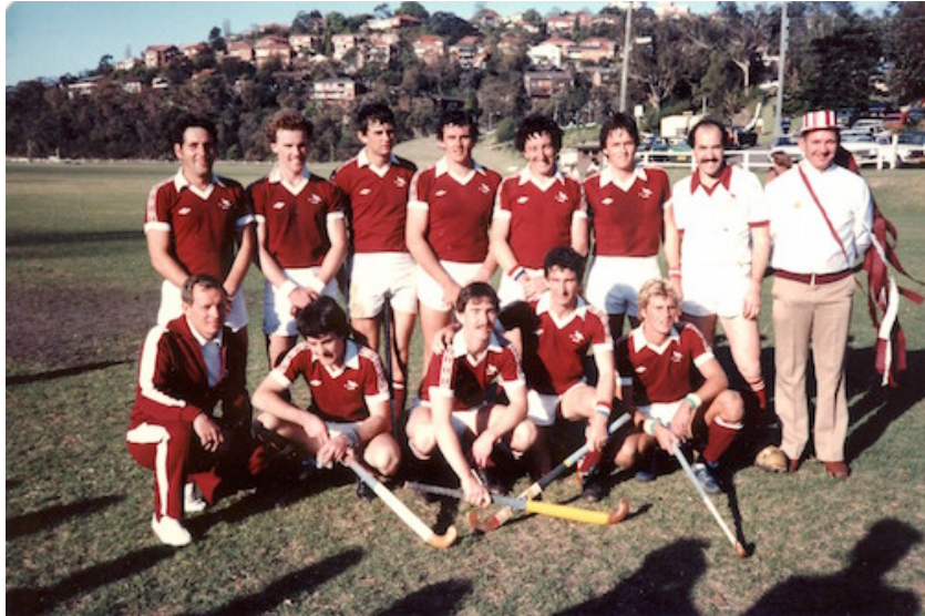
GDHC 1982 1st Grade Premiership winning side at Primrose Park North Sydney.