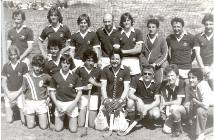
GDHC 1978 Glebe sixth grade team which won the 2nd Division C Grade Premiership photo taken at Heffron Park Maroubra.