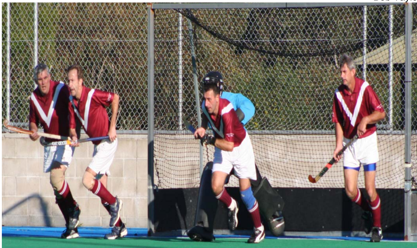
5th Grades Penalty Corner Defense