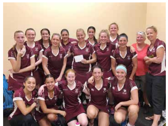
ABOVE FROM TOP Our women's history: the first women to play hockey for Glebe - the 1934 St James Women's team; the next generation in 1978 and our 2018 Grand Finalists - Fourth Grade Women