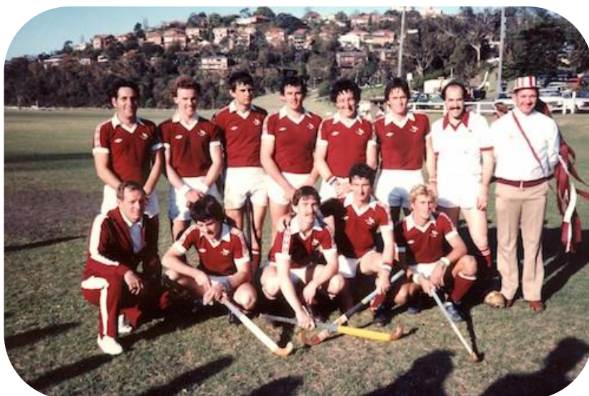
GDHC 1982 1st Grade Premiership winning side at Primrose Park North Sydney.