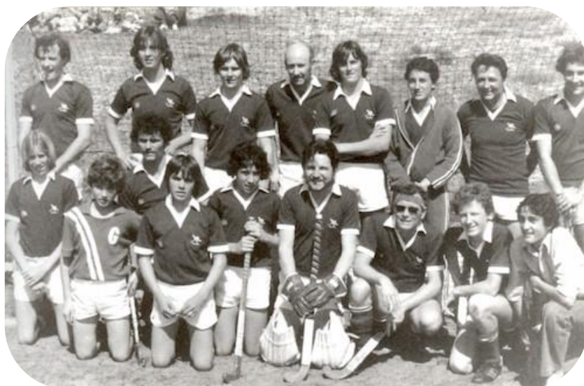
GDHC 1978 Glebe sixth grade team which won the 2nd Division C Grade Premiership photo taken at Heffron Park Maroubra.