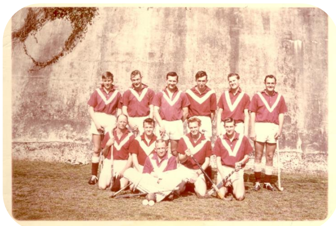
This photo was taken at Primrose Park North Sydney, of the Premiership winning second grade team of 1967