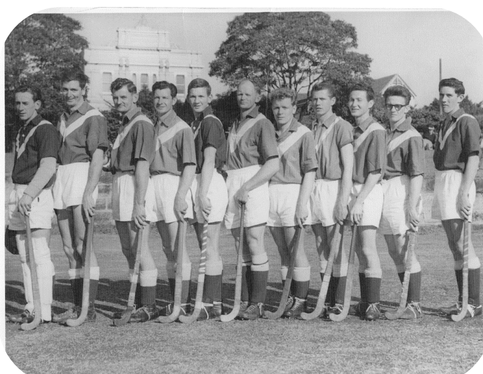
This photo of Glebe's first grade team of 1960 was taken at Saint Paul's Oval Sydney University.