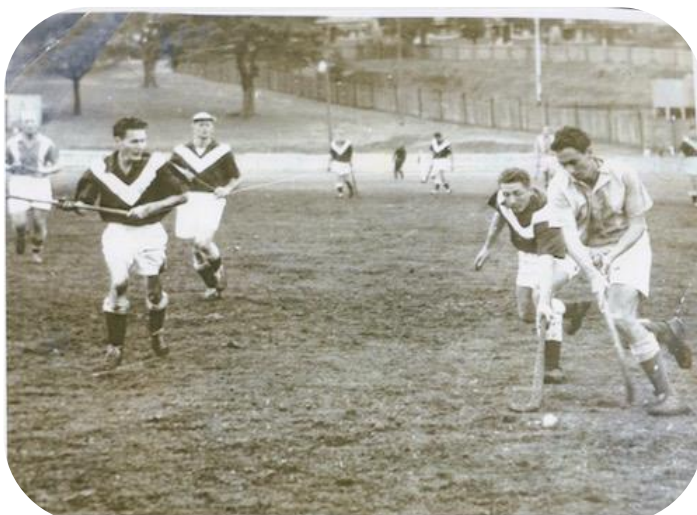
A Glebe 1st Grade game against Mosman at Jubilee Oval Glebe 1959.