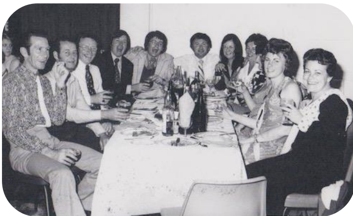
Photo taken at SHA Ball 1974.