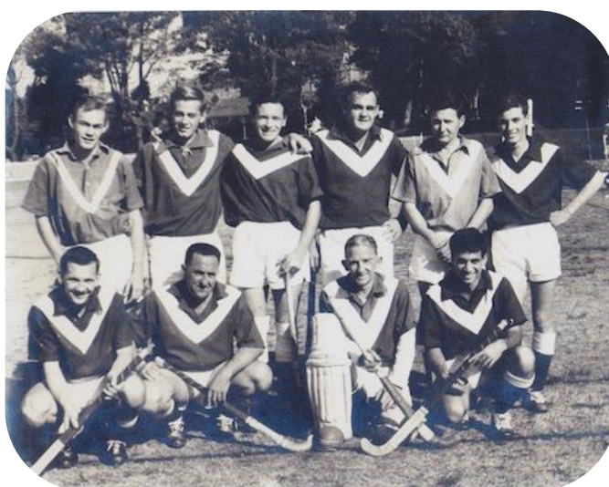
Photo of the 1965 Glebe Third Grade Team , which was taken at Sydney University Number Two Oval.