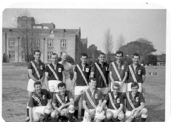
A photo of the Club's Second Grade 1968 Premiership winning team taken at Saint Paul's Oval, Sydney University after its grand-final win.