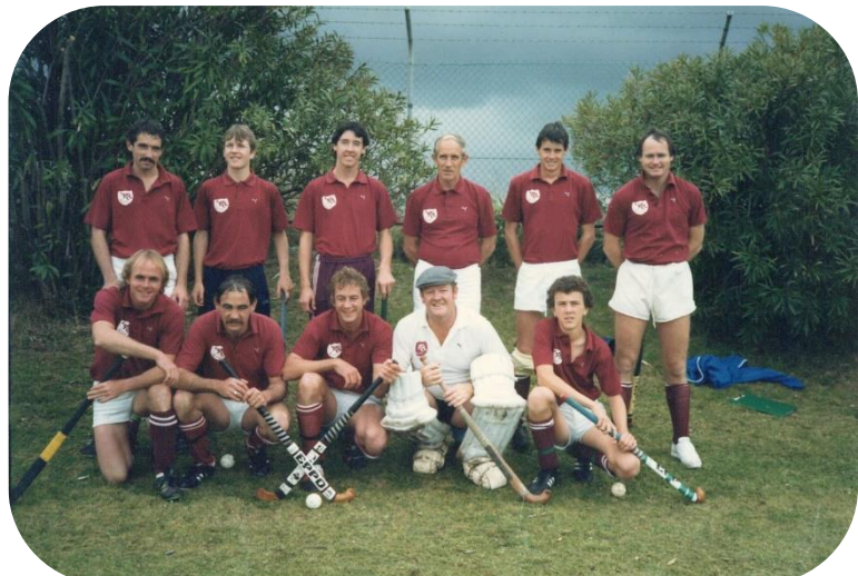
A photo of the 1985 Premiershhip winning Third Grade Team , which was taken at the bottom pitch at Homebush, which is no longer in existence.