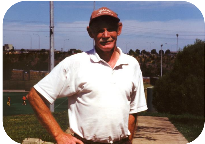
Mid 90's – Photo taken at Homebush Number 2 State Sports Centre Homebush