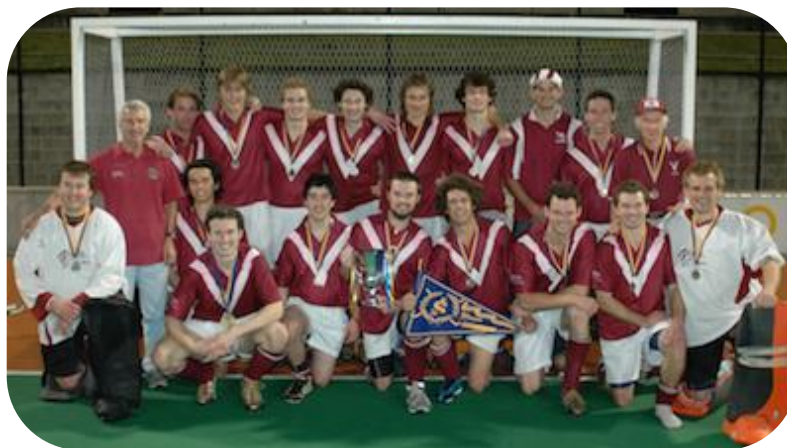
This photo of the 2008 Glebe premiership team was taken at the Homebush Olympic Pitch after its 4-2 grand-final victory against Norwest Stickers.