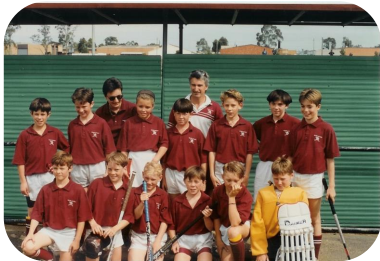
1994 Glebe U/11 Redback's. Photo taken at Moorebank Hockey Complex at the conclusion of the grand-final. With Glebe defeating Sutherland.