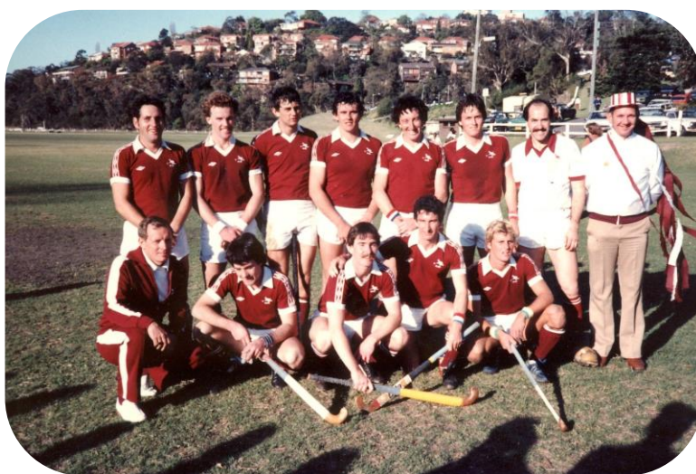
A photo of the 1982 Glebe first grade team taken at Primrose Park, North Sydney after it won the premiership in 1982.