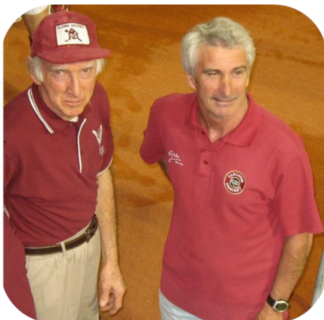
This photo was taken at the Homebush Olympic Pitch after Glebe 1 st grades 4-2 grand-final victory against Norwest Stickers.