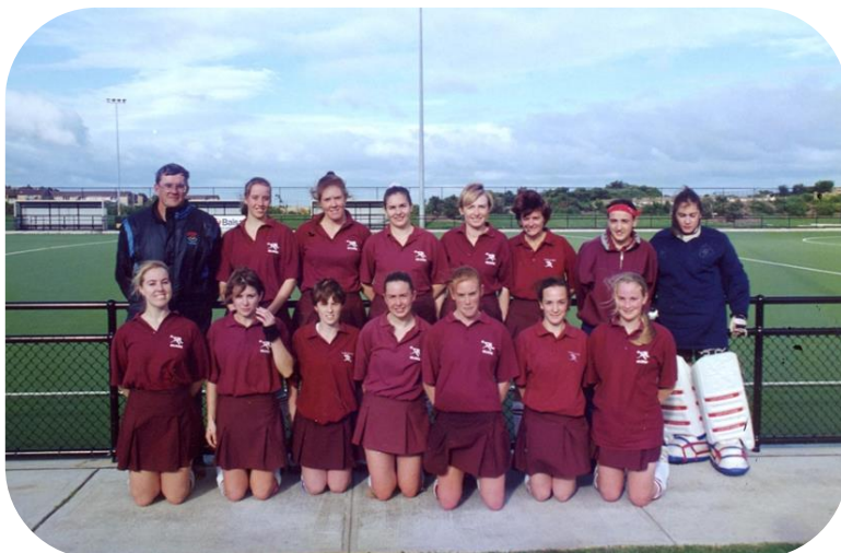
The Glebe Women's First Grade Team of 1996. This photo was taken at the Little Bay Turf the home ground of UNSW.