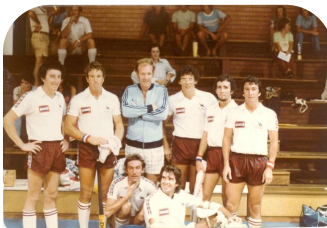
Super 8 & Indoor Champions 1978