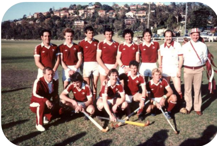
A photo of the 1982 Glebe first grade team taken at Primrose Park, North Sydney after it won the premiership in 1982.