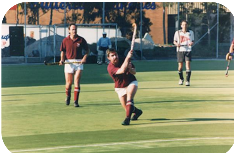
1997 4 th Grade Grand Final Glebe vs Ryde at Ryde Hockey Ground