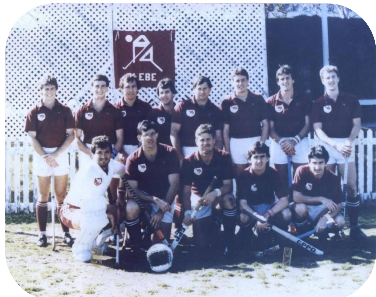
A photo of the 1985 Glebe first grade team taken at the Village Green Oval UNSW, Kensington.