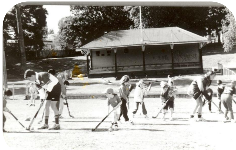
The Minkey squad of 1991 at Jubilee Oval, Glebe with the grandstand circa 1908 in the background.