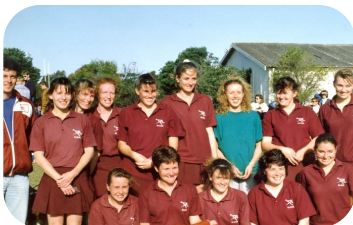
A photo of the 1992 Women's first grade team at Heffron Park, Daceyville after it won the Eastern District's Third Grade Grand-Final.