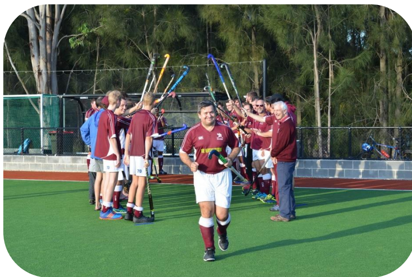
Guard of honor ~ Cintra Park Hockey Field 2017