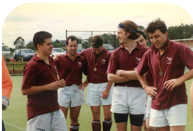
3rd Grade Grand Final vs. Ryde 1996