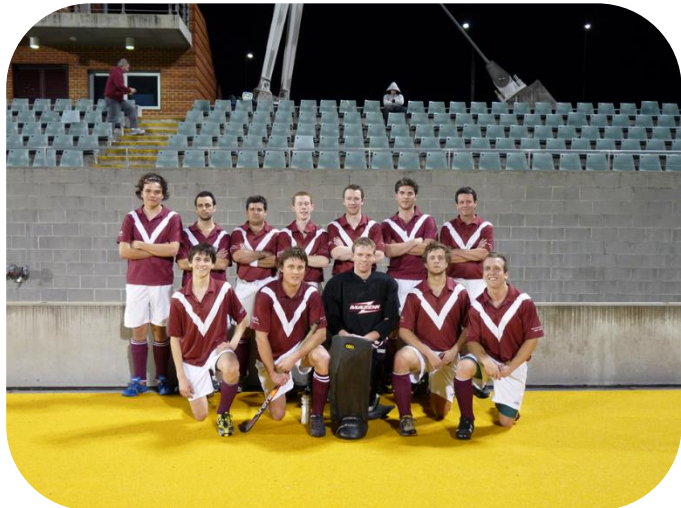
A photo of the Glebe 2010 third grade team taken at the Olympic Pitch, Homebush.

My advice for administrators is to try and keep the club's traditions going for as long as possible and not focus on modernizing every single aspect of club life.