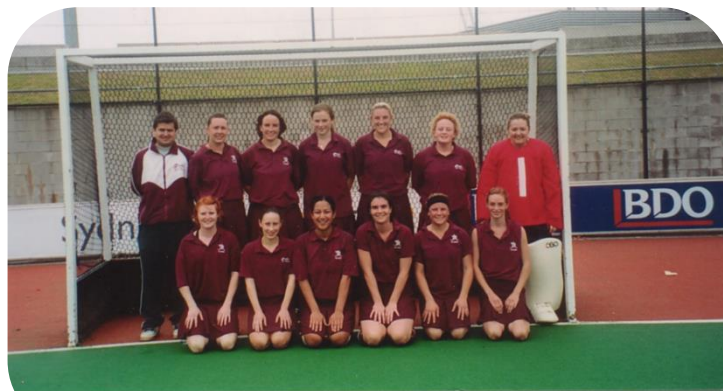
Glebe Women's Metro A Team of 2004 Photo taken at the Olympic Pitch Homebush