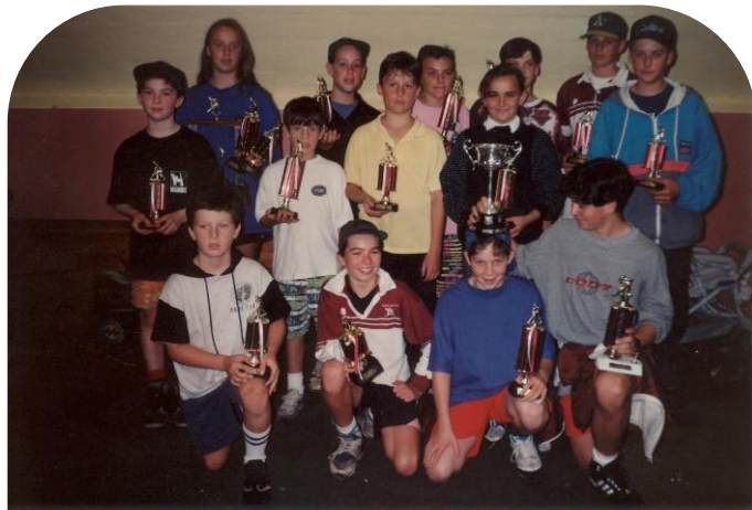
Junior Presentation Day Nov 1992