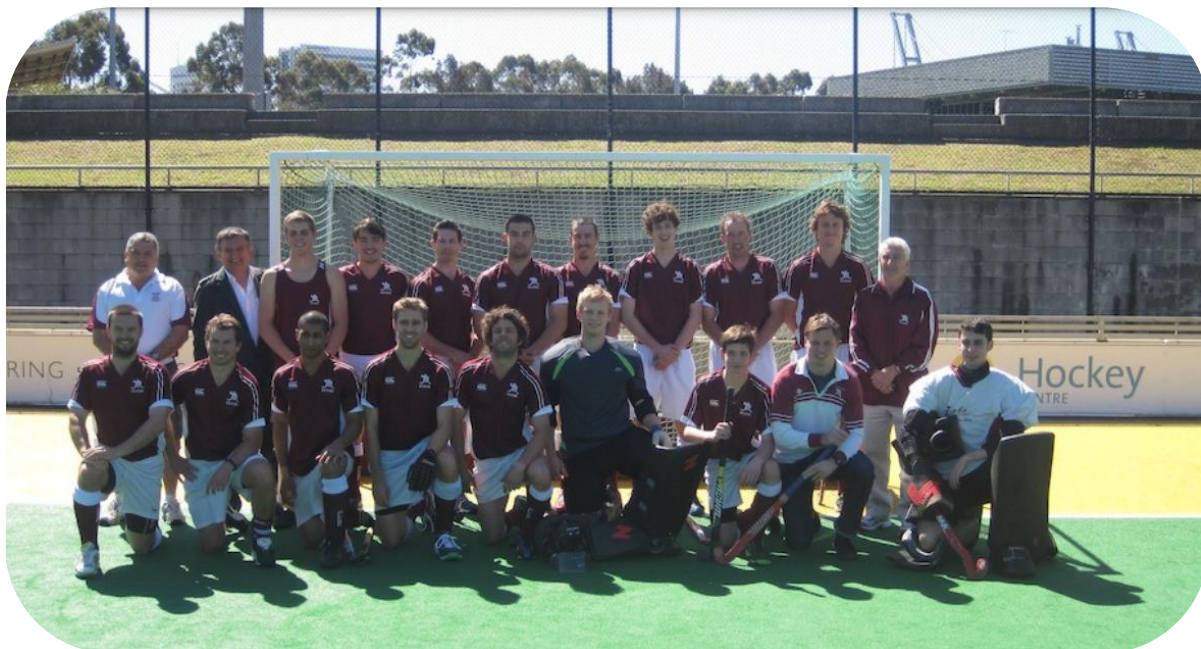
2012 2 nd Grade Team: Yates Cup, Minor Premiership and 2012 Premiership Team. Photo taken at Sydney Olympic Park.