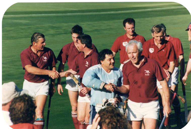
A photo taken at the Ryde Turf; North Ryde after the Glebe fourth grade team won the 1994 grand-final against Ryde.