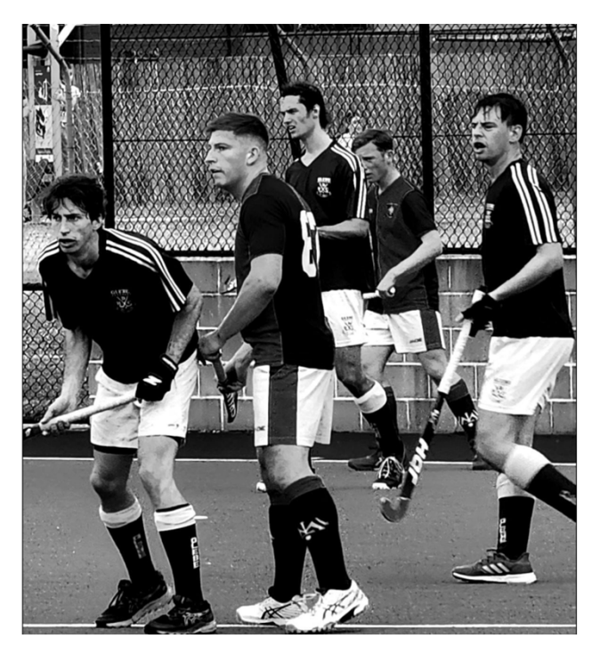
2<sup>nd</sup> Grade – determination and commitment

With a handful of rounds in the season proper to play out, I wish all teams the very best of luck. Whether your team is heading towards finals or not, I am continually impressed and proud of your efforts on and off the field. Your determination and commitment to your teammates is inspiring. Thank you for keeping our Club spirit alive and well.