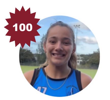
Litiana Field 100 Senior club games (inclusive of GWD games)