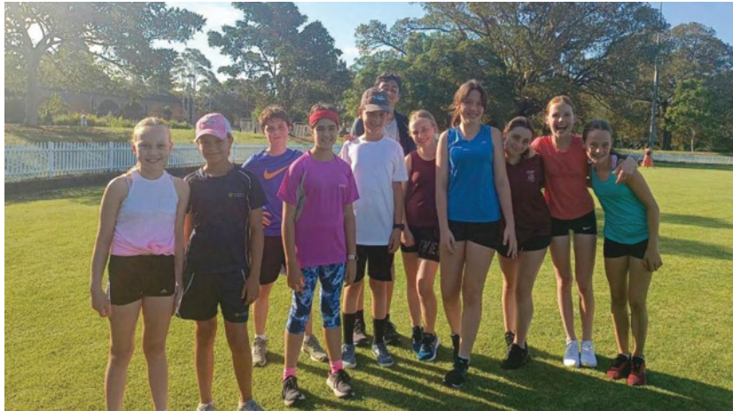
Junior fitness training on our beautiful Jubilee Oval.