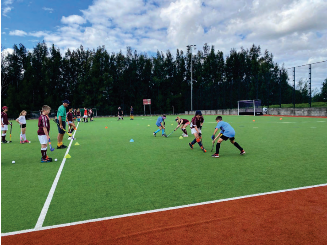
In action at Development Academy long day format during School Holidays.