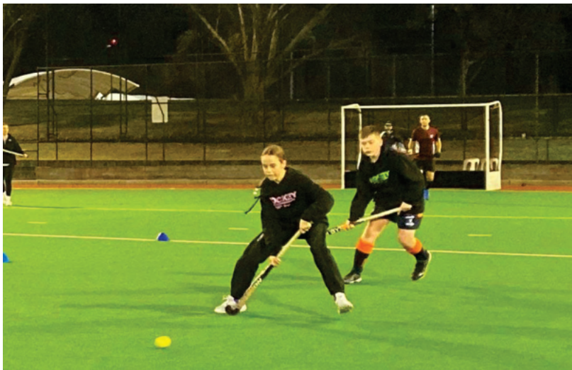
Junior Accelerator program in action on Thursday evenings