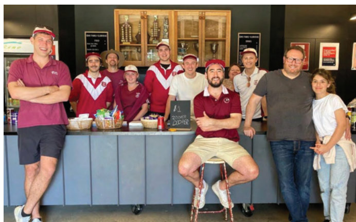
Fantastic support led by our GDHC Men at the 2023 Juniors Carnival.