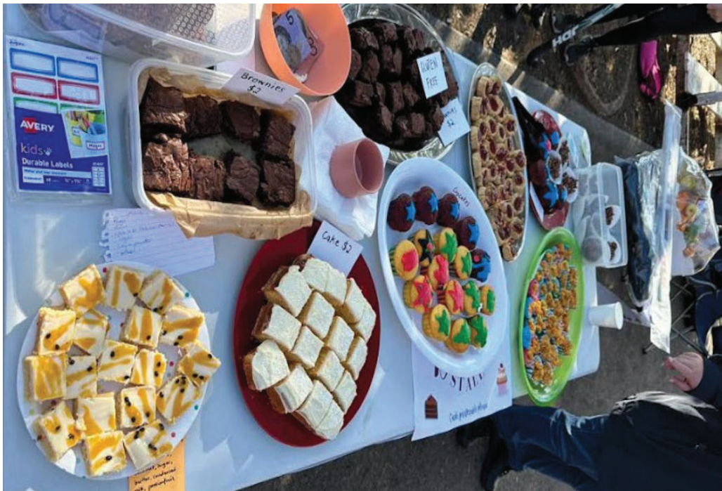
The famous GDHC Cake Stall.