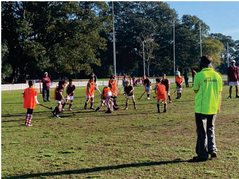
It was a stunning day on the oval.