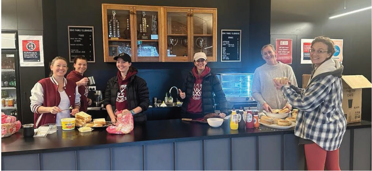
Saturday Juniors at Jubilee, led by our ML3 Women.