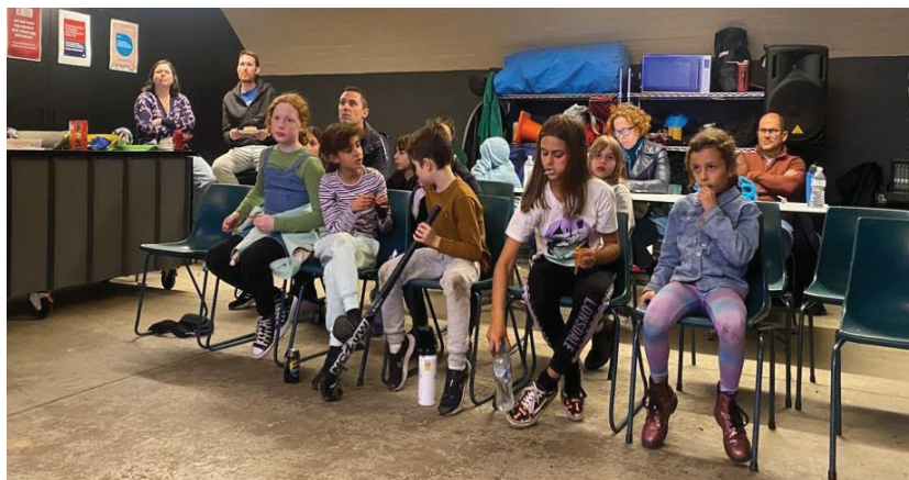
U11 catchup at the Clubhouse.