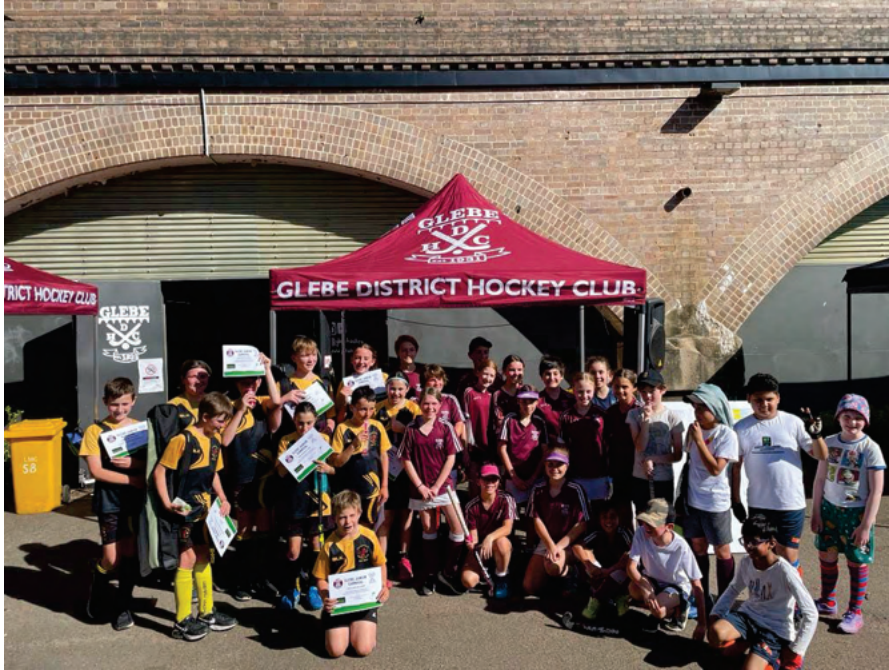
Some of the teams from the U13 Division.

We were delighted to run the Glebe Junior Carnival for the first time in 4 years (after several years of pandemic and rain!) with 4 divisions encompassing U9 to U13. We had over 100 Juniors playing in the event from Glebe, other SEHA Clubs, Mosman and the Entrance.