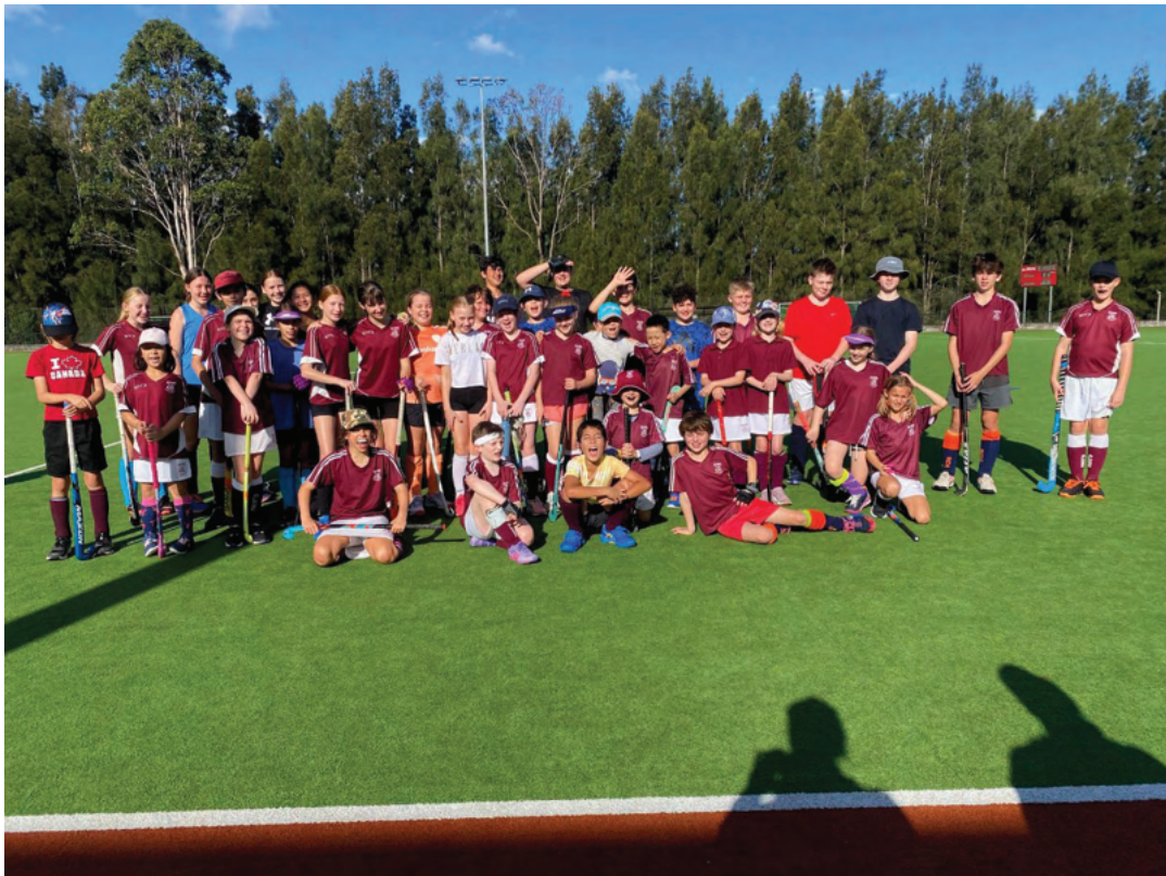
One of our many Development Academy sessions this season.